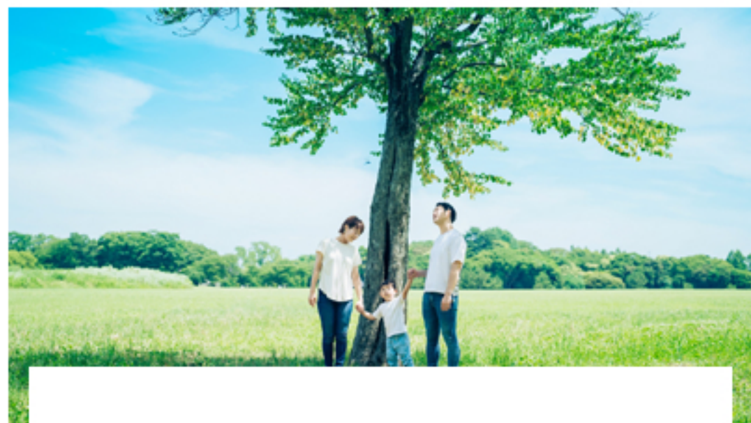
Efforts for sustainability