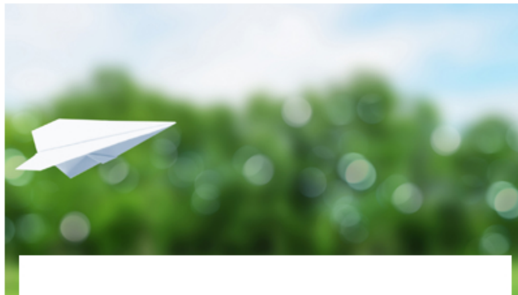
Way of thinking about sustainability