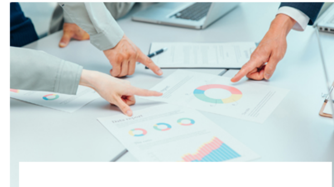
Promotion system of sustainability